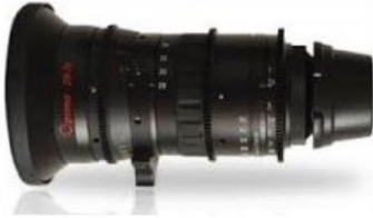
Angenieux Optimo 28-76