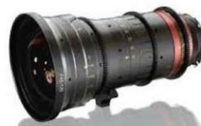
Angenieux Optimo 45-120