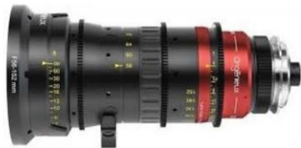
Angenieux Optimo Anamorphic 56-152