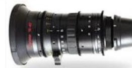
Angenieux Optimo 15-40