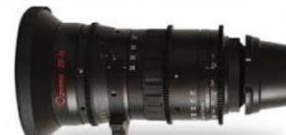
Angenieux Optimo 28-76