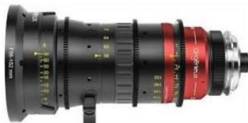
Angenieux Optimo Anamorphic 56-152