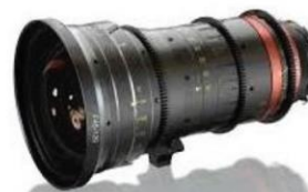
Angenieux Optimo 45-120