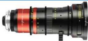
Angenieux Optimo Amorphique 30-72