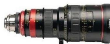
Angenieux Optimo 19,5-94