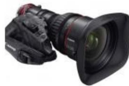
Canon Cine Servo 17-120