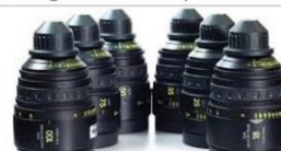
Master or Ultra Prime