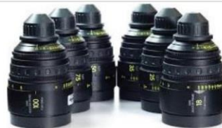
Master or Ultra Prime