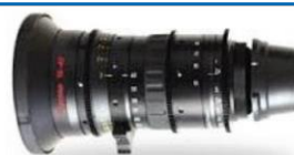
Angenieux Optimo 15-40