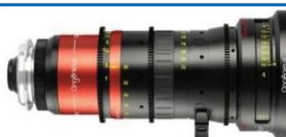
Angenieux Optimo Amorphique 30-72