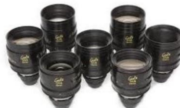
S4 or S5 Cooke Lens