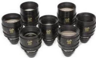
S4 or S5 Cooke Lens