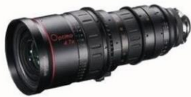
Angenieux Optimo 17-80