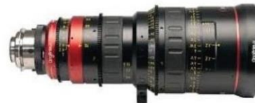
Angenieux Optimo 19,5-94