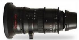
Angenieux Optimo 28-76