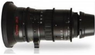
Angenieux Optimo 28-76