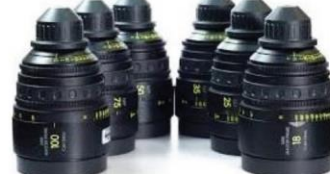
Master or Ultra Prime