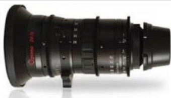
Angenieux Optimo 28-76