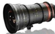
Angenieux Optimo 45-120