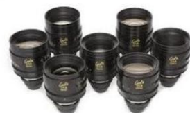
S4 or S5 Cooke Lens