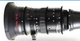
Angenieux Optimo 15-40