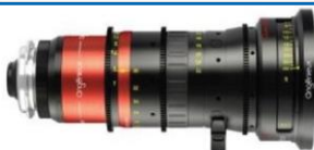
Angenieux Optimo Amorphique 30-72