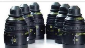
Master or Ultra Prime