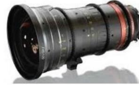
Angenieux Optimo 45-120