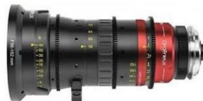
Angenieux Optimo Anamorphic 56-152