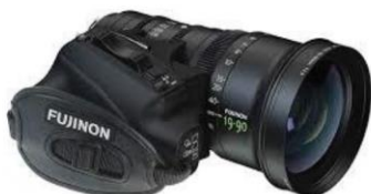
Fujinon Cabrio 19-90