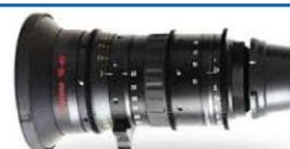
Angenieux Optimo 15-40