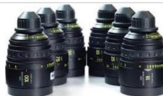
Master or Ultra Prime